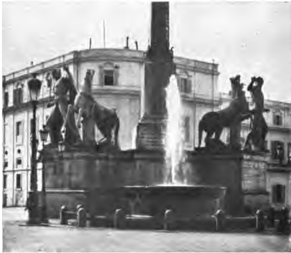
Fig. 74. The Dioscuri (Ancient statues now set up before the king's palace in Rome).

The Dioscu'ri, Castor and his brother Polydeu'ces, the latter better known by his Roman name, Pollux, were the local heroes of Sparta.